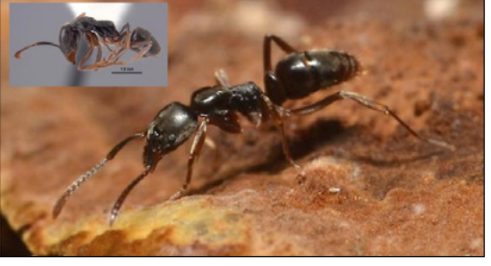
Figure 1—Asian needle ant (Brachyponera chinensis) worker. (bar is 1 mm for scale)

Their stings may result in a life-threatening allergic reaction called anaphylaxis