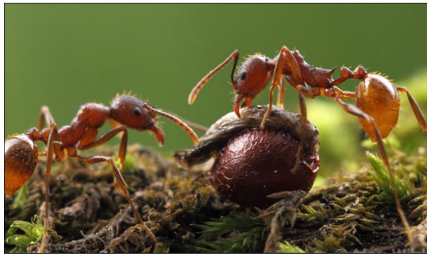
Figure 4—Aphaenogaster worker ants (shown here) are important seed dispersers. Asian needle ants decrease populations of Aphaenogaster, thus interfering in this natural and essential seed dispersal process.

Perhaps the most troubling characteristic of Asian needle ants is their sting. While they are not terribly aggressive, like the more familiar red imported fire ants, their stings are painful, often affecting different people in different ways. In fact, the sting can result in life-threatening anaphylaxis, an acute allergic response (see list of symptoms above) (Cho and others 2002, Fukuzawa and others 2002, Leath and others 2006, Nelder and others 2006). Stings are often reported to result in intense pain at the site of the sting that comes and goes over the course of several hours. Some people experience pain away from the sting site. Redness of the skin and mild to severe urticaria (hives) are reported as symptoms. In a study in the native range of the Asian needle ant, 2.1 percent of people stung exhibited anaphylaxis (Cho and others 2002). While anaphylaxis has been reported in the United States (Nelder and others 2006), the percentage of people who have developed hypersensitivity (increased allergic response that can lead to anaphylaxis) to Asian needle ant stings is unknown. People who are hypersensitive to other stinging insects may be at increased risk of anaphylaxis from Asian needle ant stings (Cho and others 2002, Kim and others 2001).