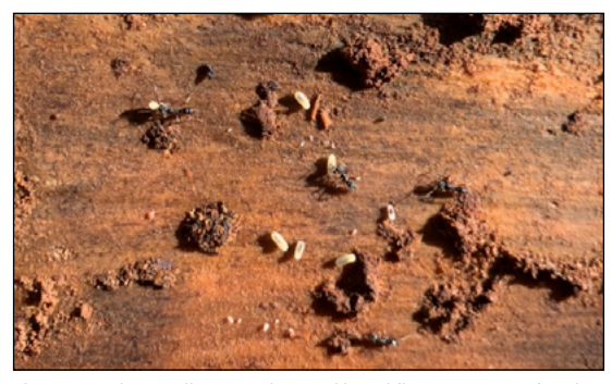
Figure 3—Asian needle ant workers and brood (immature stages) under a rotting log.